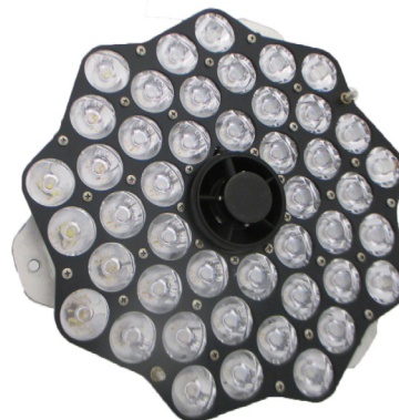
LED High Beam – PAR 64 Wing Root Landing Light

All PAR 64 Wing Root 737 NG, 757, 767, 777