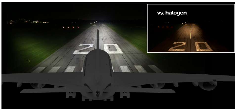
LED High Beam vs. Halogen